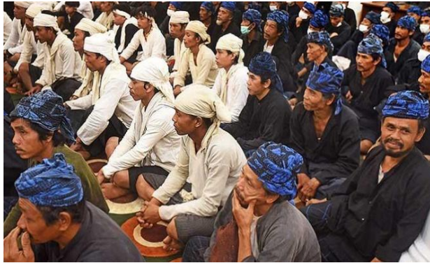
Figure 1. Inner Baduy and Outer Baduy Community

The Baduy community is divided into two main groups: the Inner Baduy and the Outer Baduy. Both groups strongly uphold cultural traditions that shape their daily lives. Their way of life is rooted in simplicity, harmony with nature, and strict adherence to customary laws known as pikukuh . These values not only define the Baduy identity but also serve as the foundation for their sustainable way of living (Krisnadi, 2024).