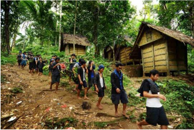
Figure 4. Local wisdom of the Baduy tribe in preserving nature

Tolerance is key to creating harmony between Baduy and Islamic traditions. Tolerance means respecting differences and a willingness to understand and accept different values as part of the commonwealth (1001indonesia.net, 2016). Tolerance in Islam is a fundamental principle consistently emphasized by the Prophet Muhammad. This value is exemplified in the Medina Charter, which serves as a model for peaceful coexistence in multicultural societies. In the context of the Baduy community, tolerance is evident in their respect for the religious practices of their Muslim neighbors. Likewise, the Muslim community reciprocates by honoring the traditional rituals of the Baduy (Fadli, 2024).