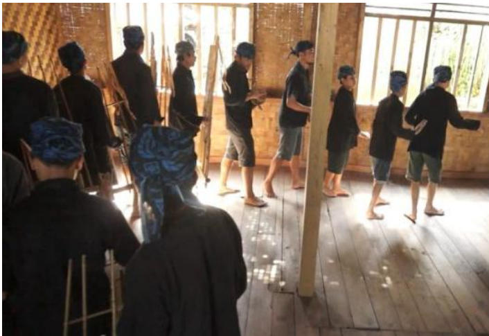
Figure 3. Dugdug Rempug, a typical community service of the Baduy community

This research identifies several opportunities to foster harmony between Baduy and Islamic traditions. A key opportunity lies in the shared core values of both systems. For instance, the principles of simplicity, honesty, and cooperation, central to the Baduy tradition, are closely aligned with Islamic teachings. Simplicity is considered a form of piety in Islam, as reflected in the words of the Prophet Muhammad SAW, “Simplicity is part of faith” (HR. Abu Dawud). Likewise, cooperation, an inseparable part of Baduy community life, is similar to the concept of ta’awun or mutual assistance in Islam.