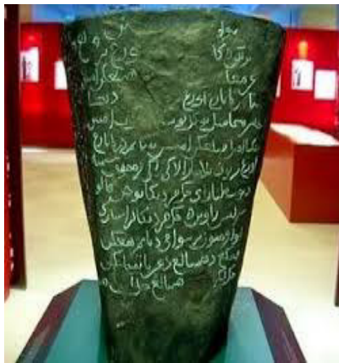
Photo 2: The Terengganu Inscription is now in the National Museum of Terengganu.