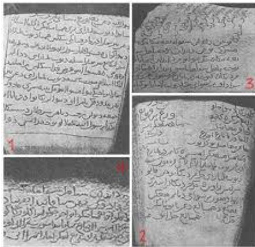
Photo 1: Four inscribed sides of the stone of Terengganu Inscription.

449). The inscription also shows that there was already a written tradition in Terengganu (Hashim, 1991: 2). The Terengganu inscription records a decree by a Muslim sovereign who promulgated Islamic law for his subject (Drewes, 2001: 143). This decree suggests that the “King” was quite eager to introduce and disseminate his new faith.