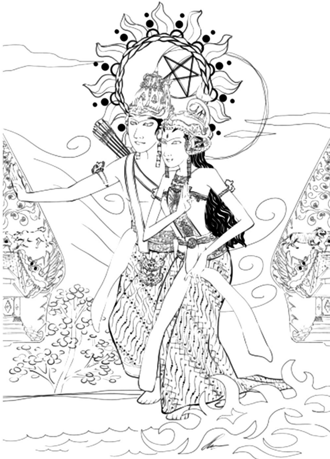
Figure 1 Javanese men performing rituals

Dewi Sinta Dewa – Kasasarmah Gan Di Alas Roban Alah Dewa Rama Mika Cinta – Mika Cinta Kasasama Hiji – Hiji Dasar Dasar Kabangsaan Hiji Dasar Da Kabangsaan 5