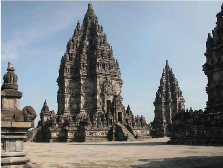
Figure 3. Prambanan Temple Complex in East Java

Oral tradition of Indonesia is as old as it is in the adjacent regions: Burma, Malaysia, Thailand, and Laos. However the mode of oration or performance in Indonesia differs from those of mainland India. 22