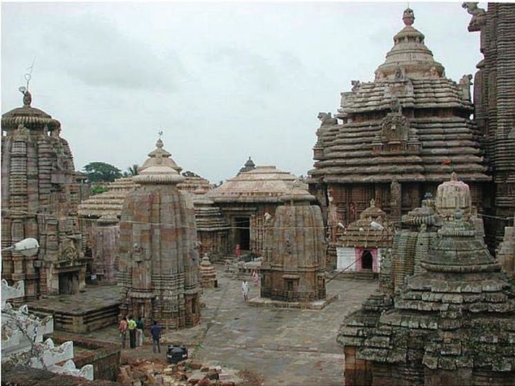
Figure 2. Lingaraj Temple of Bhubaneswar, Odisha 21

There are so many ways - theatre, ballet, songs, puppetry in which the tales of Ramayana and Mahabharata are expressed around the world. And yet South east Asia, and Indonesia in particular, have their own special perspective.